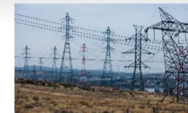
What is a smart grid?