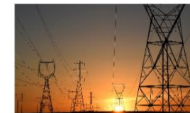
PNNL Grid Experts Discuss Opportunities of Infrastructure Bill