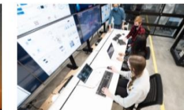
Cybersecurity Concerns - From Pacific Northwest to Ukraine