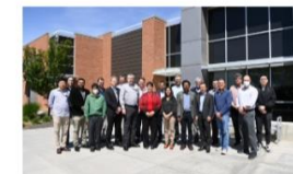
AGI Researchers Meet in Richland for Strategy meeting