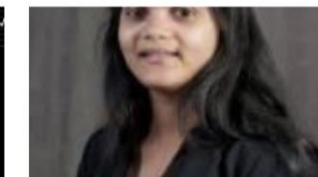
WSU Promotes AGI Professor