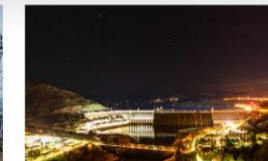
Going green: How AGI is changing the power grid